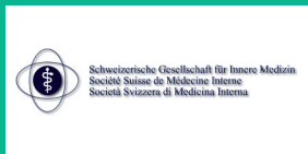
Swiss Society of Internal Medicine 6 points