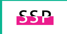
Swiss Society of Periodontology (SSP) 6 hours